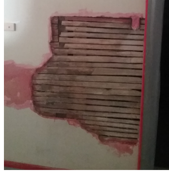
The wall after the damaged plaster had been removed.