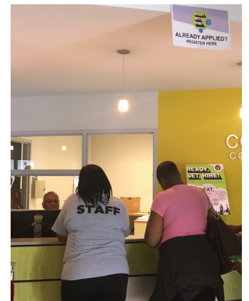
Ready, Set, Hire staff assisting with applications and registration