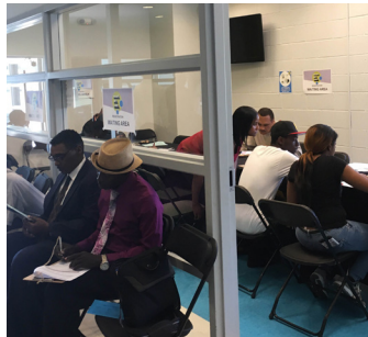
Applicants filling out paper work for DGS and Rec and Parks